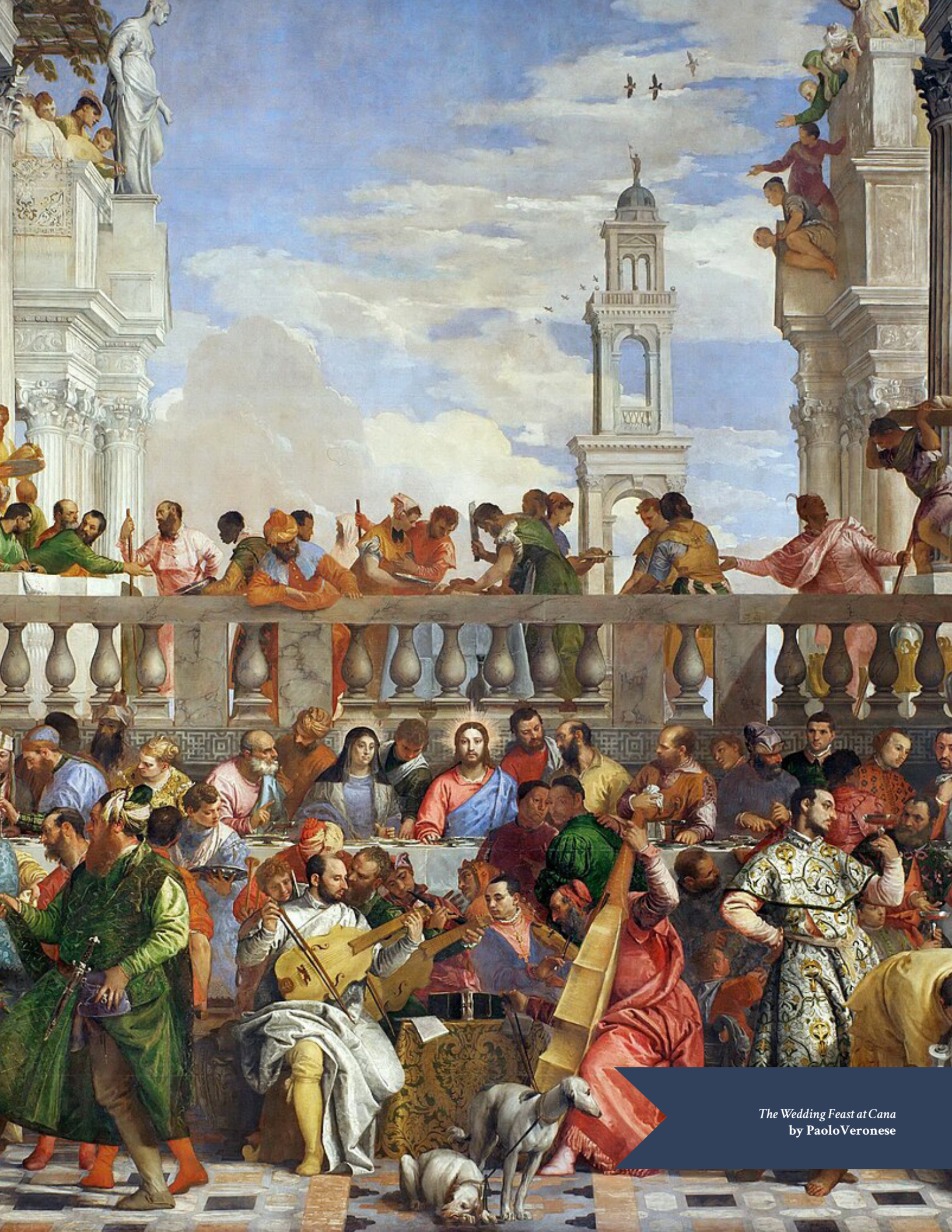
The Wedding Feast at Cana by Paolo Veronese