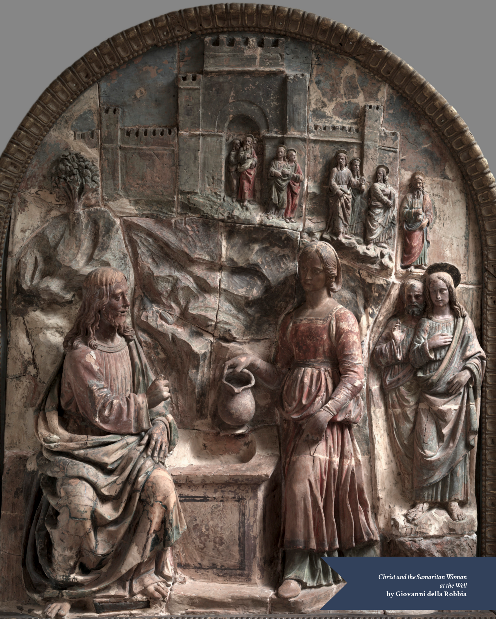
Christ and the Samaritan Woman at the Well by Giovanni della Robbia