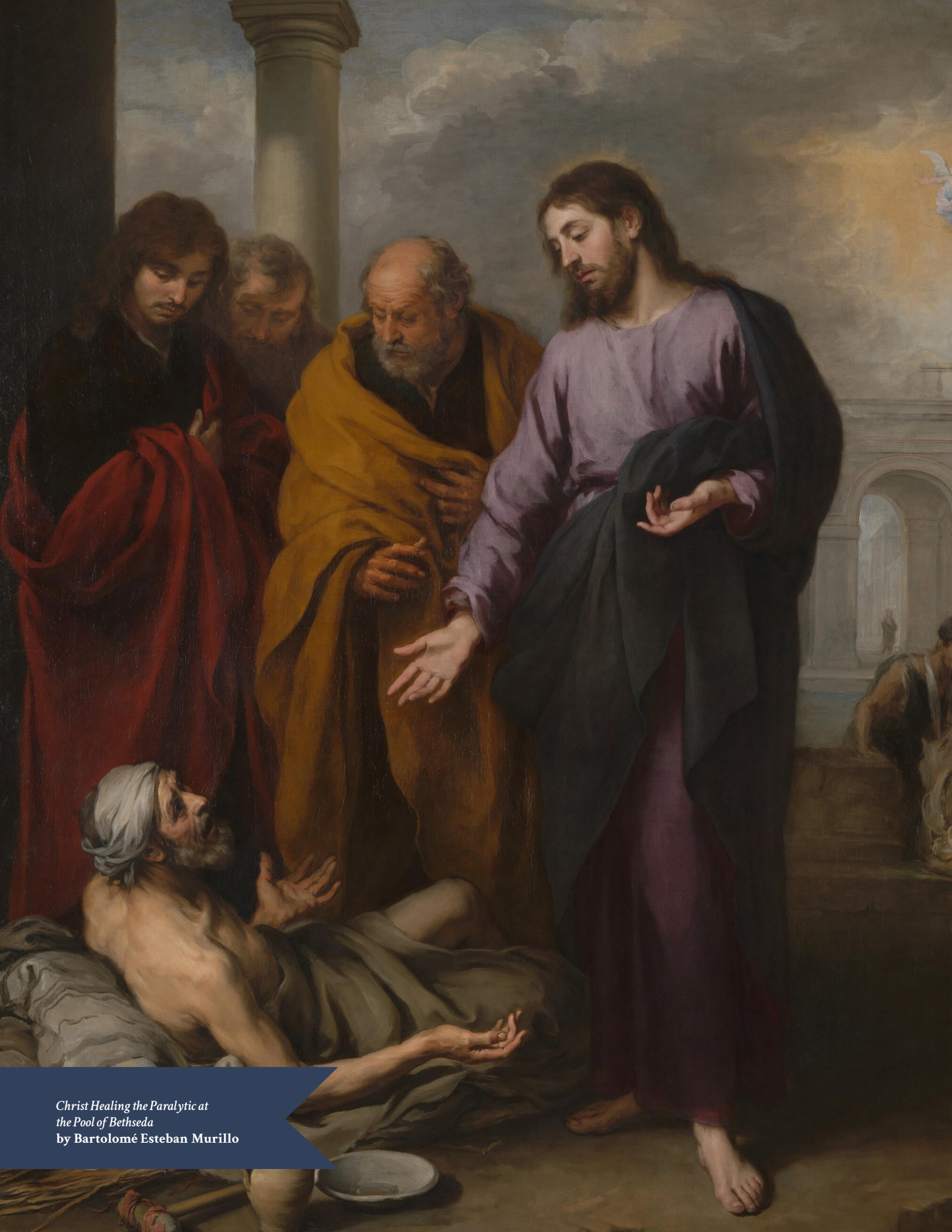
Christ Healing the Paralytic at the Pool of Bethesda by Bartolomé Esteban Murillo