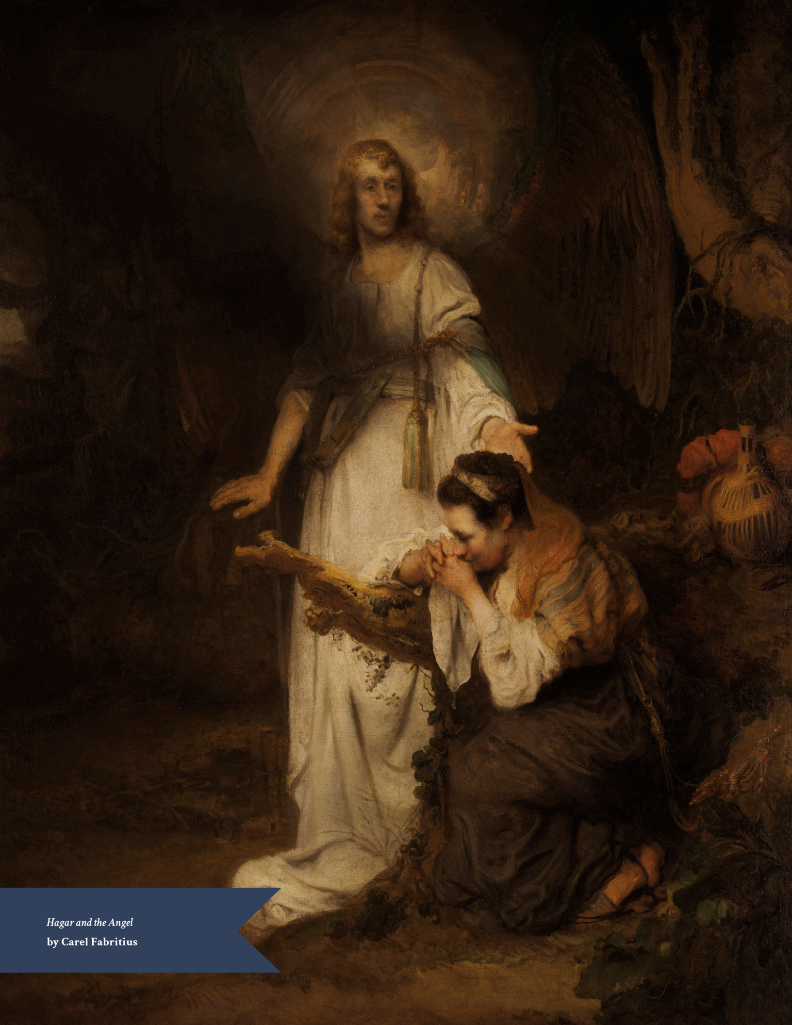
Hagar and the Angel by Carel Fabritius