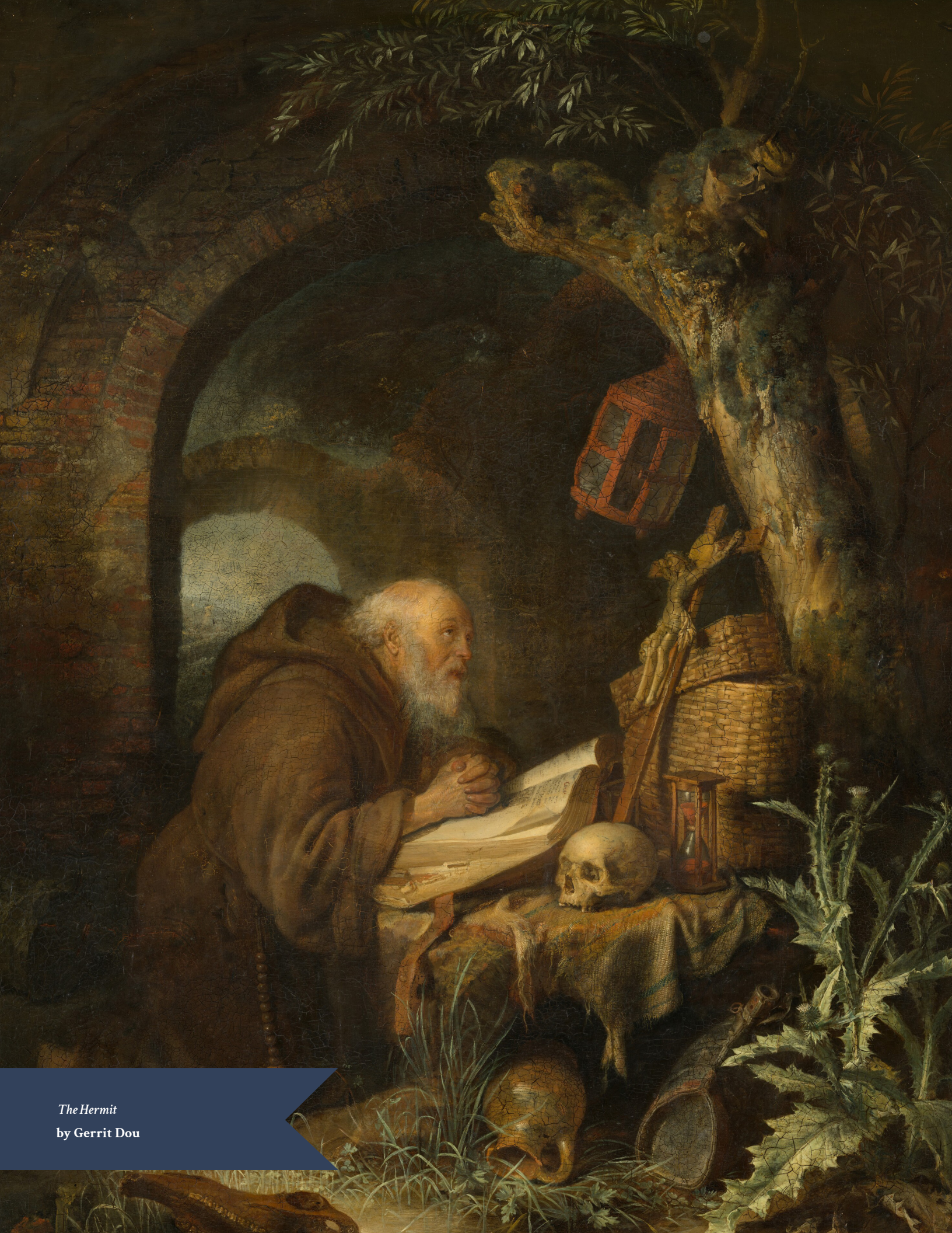
The Hermit by Gerrit Dou